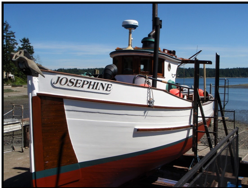
Figure 3 haulout and ready to re-launch