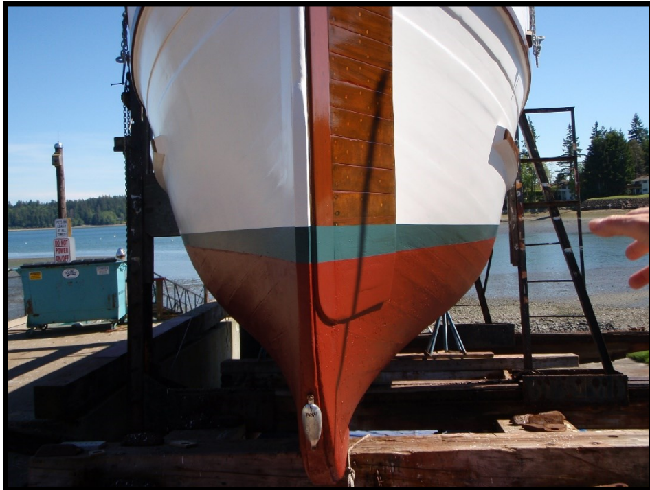
Figure 6 Bow View of Josephine