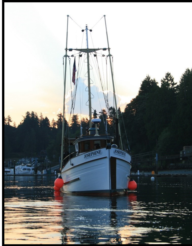
Figure 17 Here she sits patiently waiting for her next adventures.