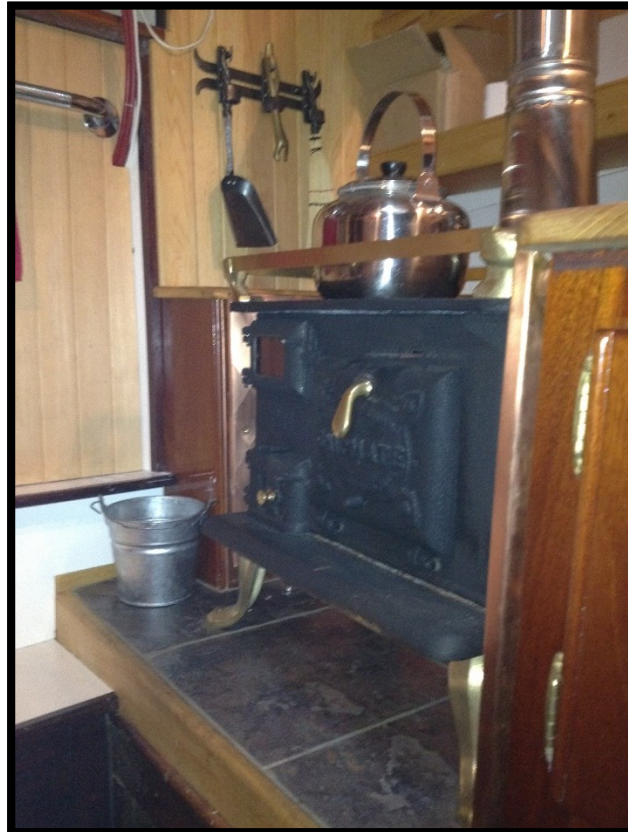
Figure 9 Focsle galley Shipmate stove