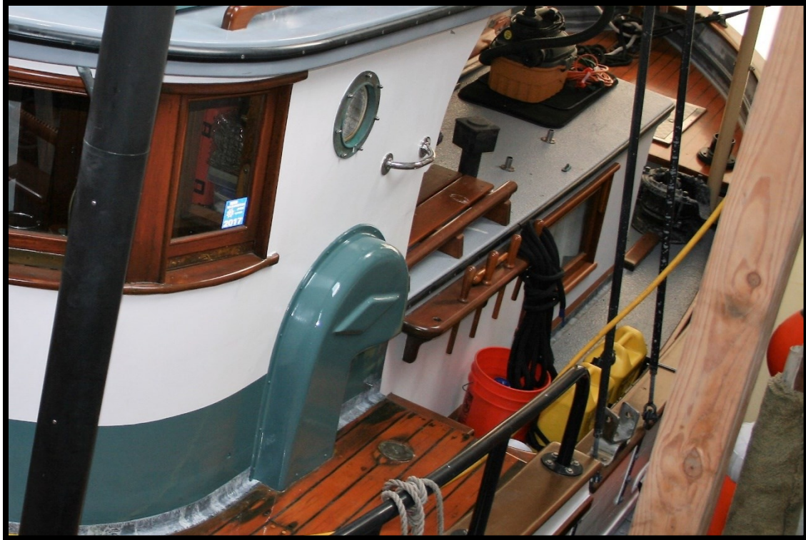
Figure 7 Details of portside deck and mooring line rack