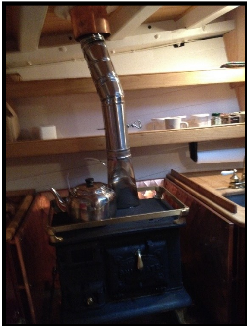
Figure 10 another view of Shipmate wood/stove with oven