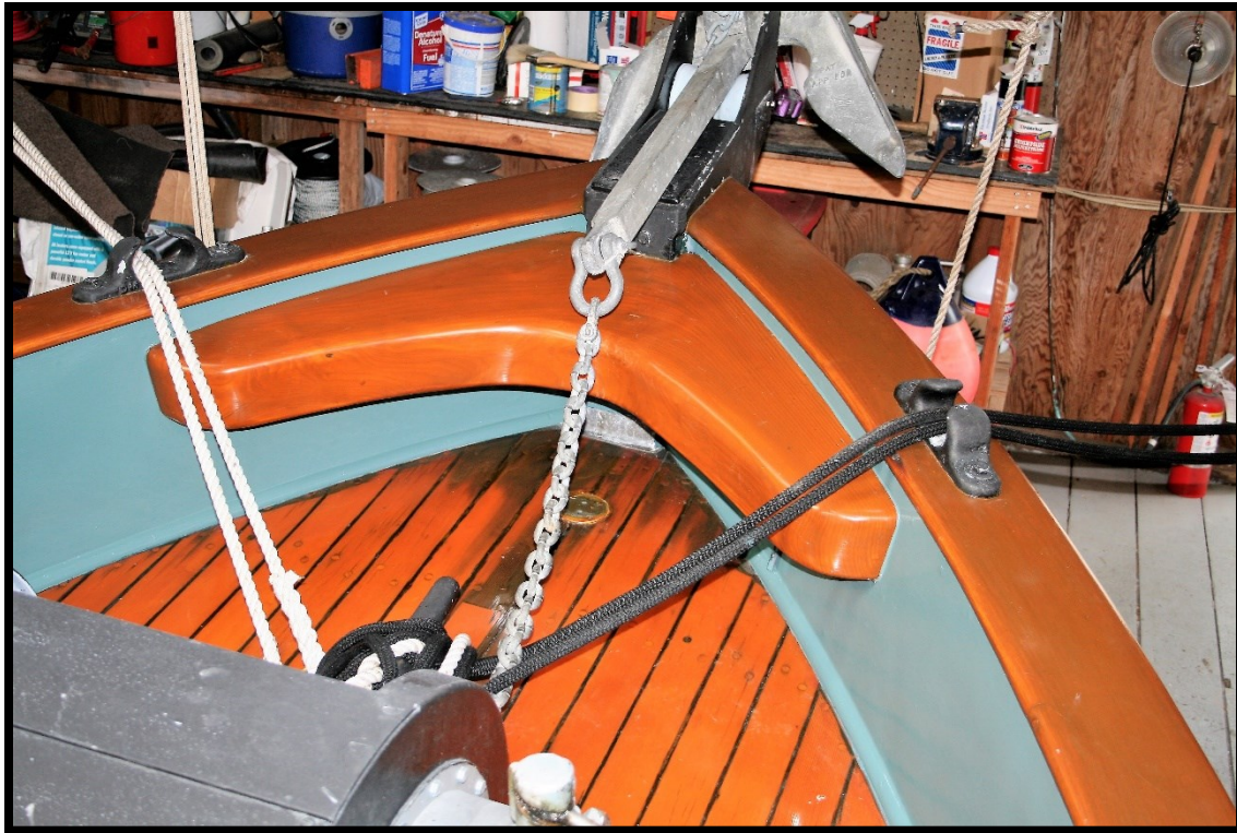
Figure 2 natural hackmatack stem knee forward