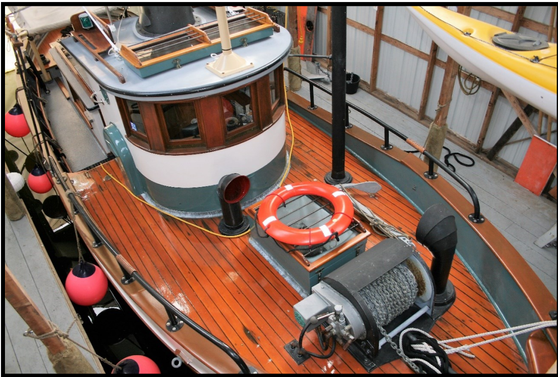
Figure 1 view of Josephine in boathouse, large hydraulic anchor windlass, bow, and pilothouse

Covered Cockpit boom tent with rolled up side curtains, makes the aft deck shaded and weather tight