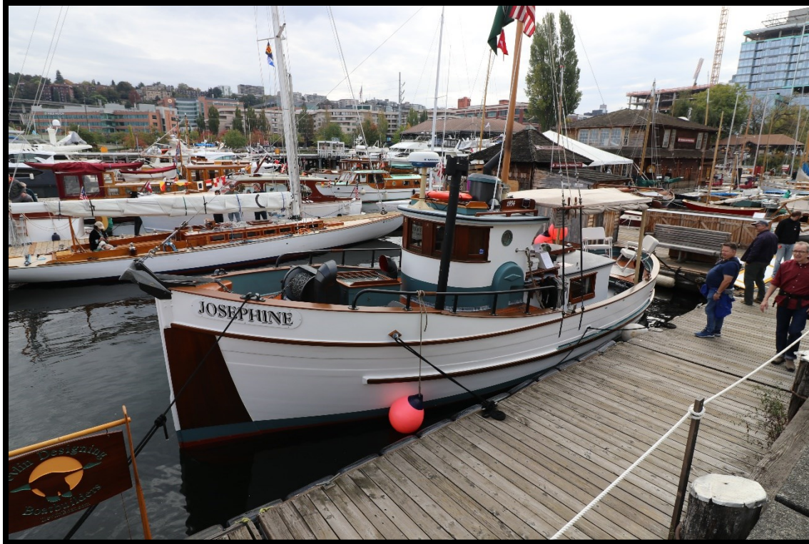
Figure 18 at a boatshow in Seattle