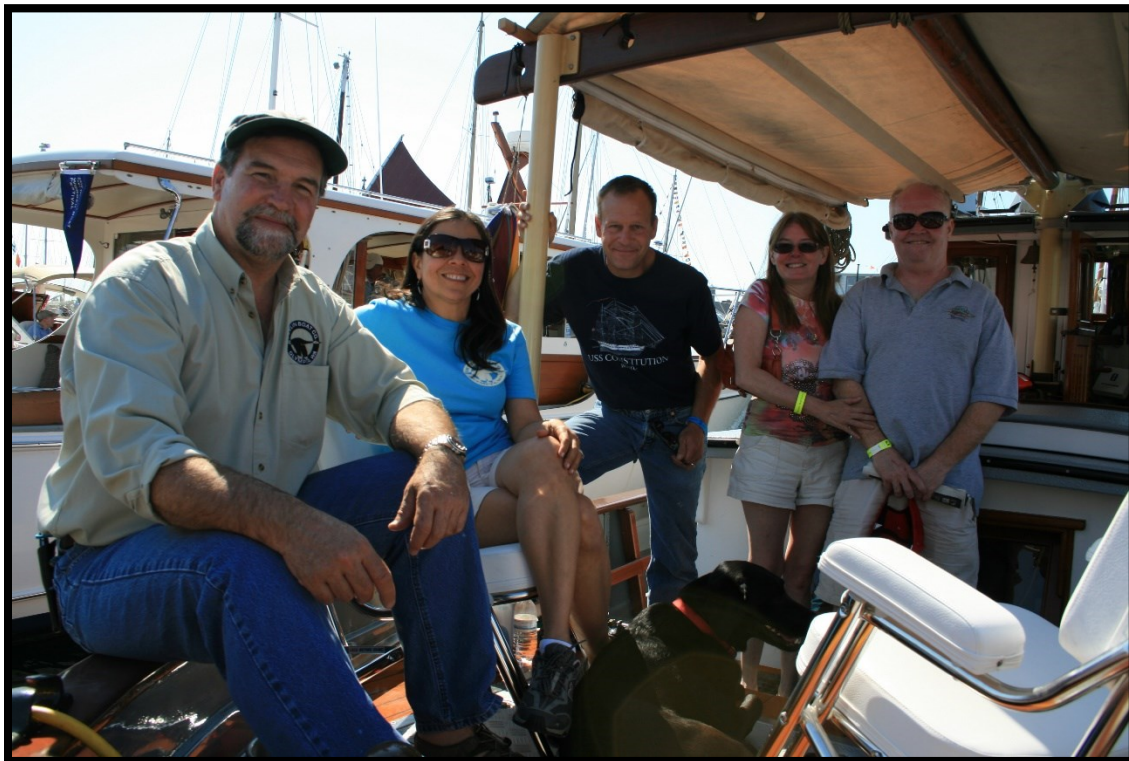
Figure 19 of the four total owners in Josephines life, shown here are the three of them on board Josephine