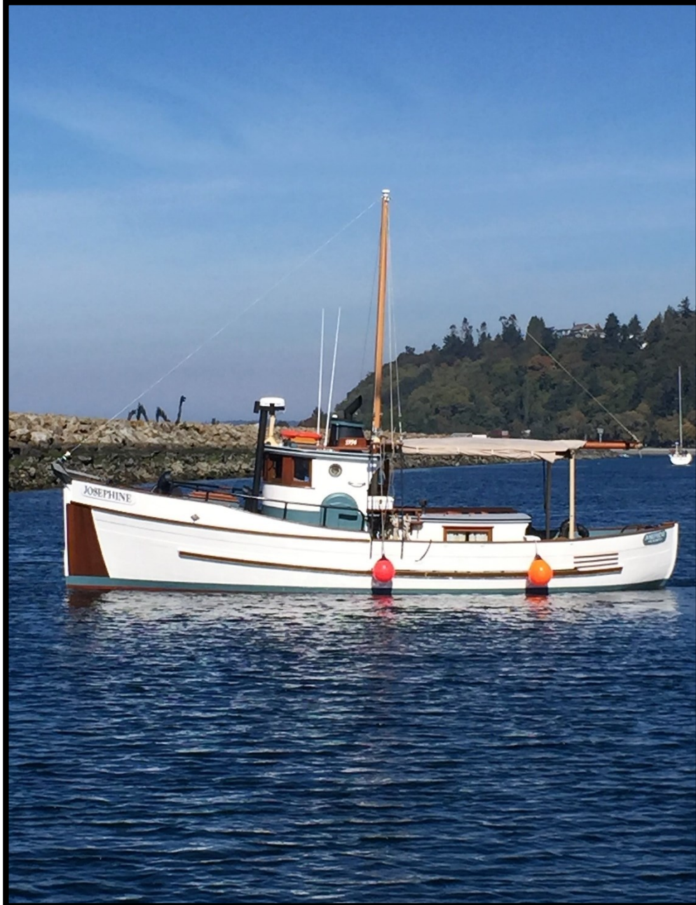
Josephine a retired Alaska Salmon Troller

2424 GRAVELLY BEACH LOOP N.W. * OLYMPIA, WA. 98502 360-866-0164