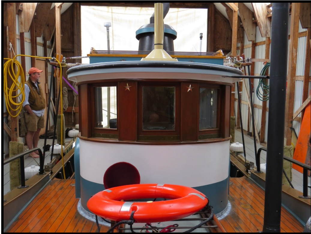
Figure 14 Front of pilothouse looking aft