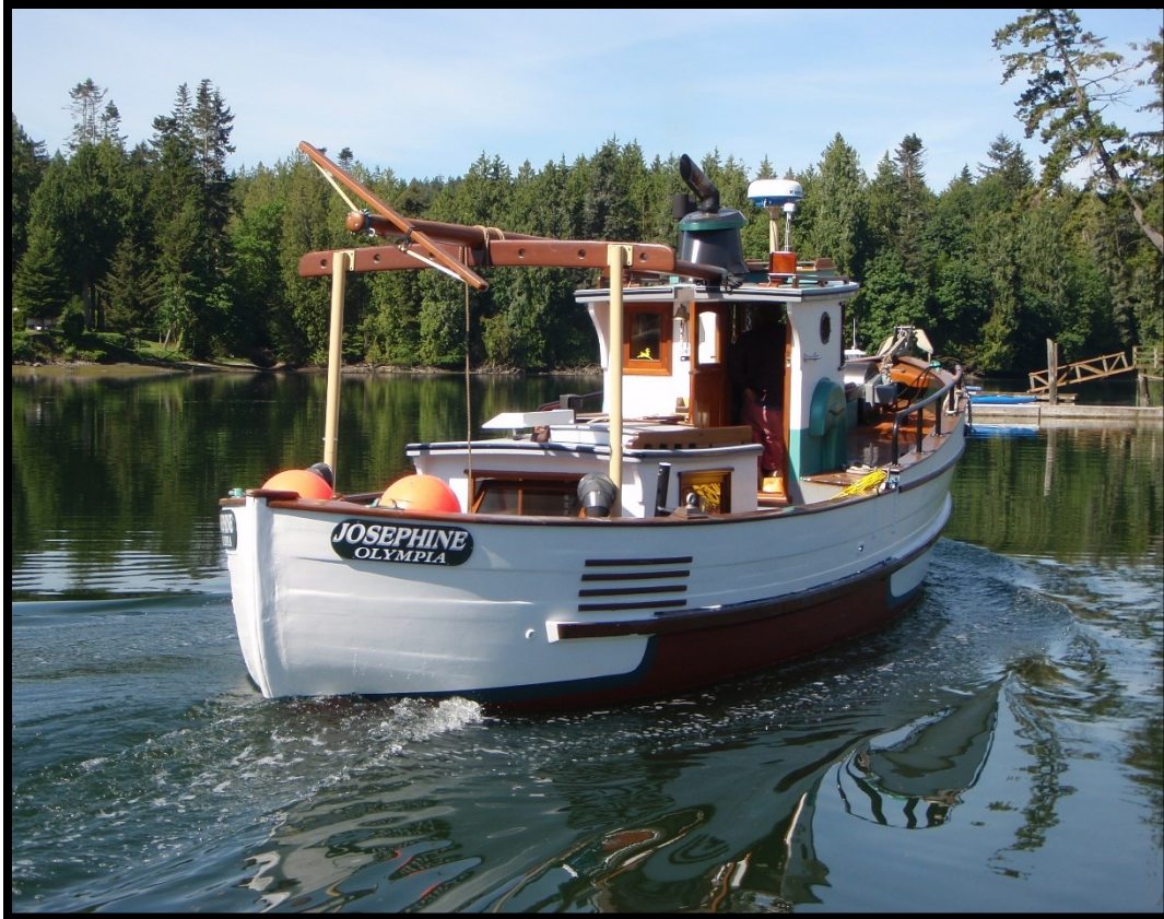
Figure 12 Stern view after annual haulout, without mast