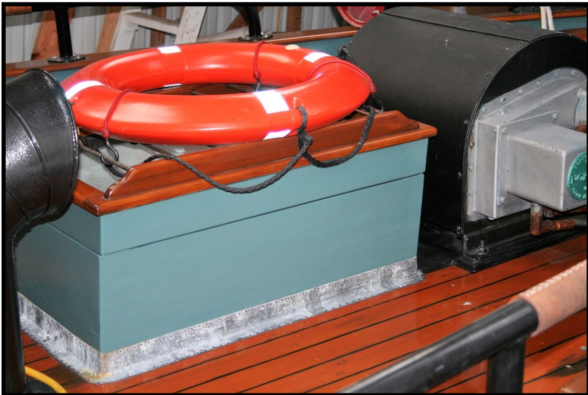
Figure 8 focslight skylight hatch with tingling at base.