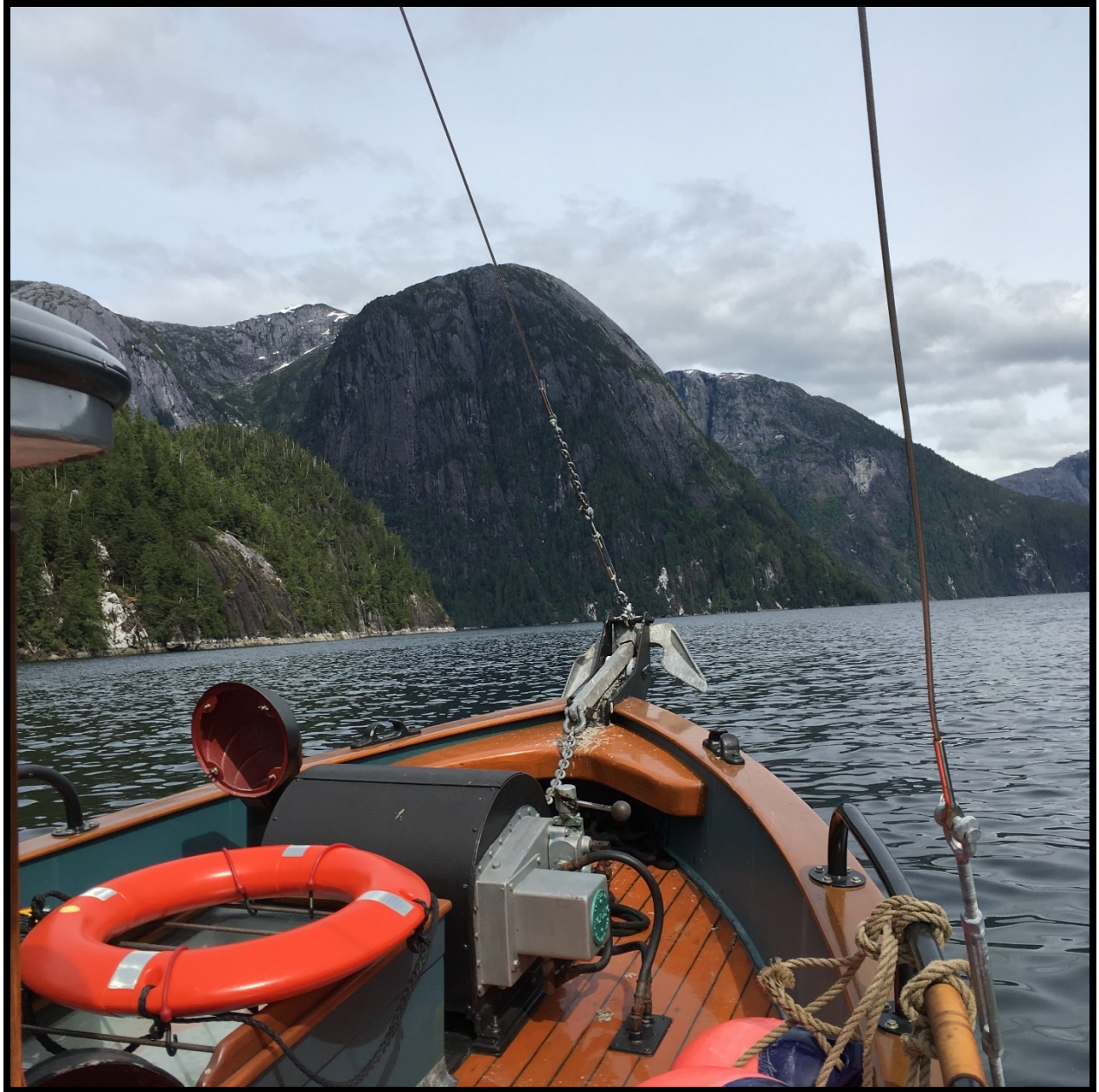
Figure 20 with her bow pointe north there is only adventure ahead

Asking Price is $125,900 ready to Cruise, Fish, Explore and anything else you can imagine. Contact Sam Devlin about viewing her. sam@devlinboat.com 360-402-9824 cell.