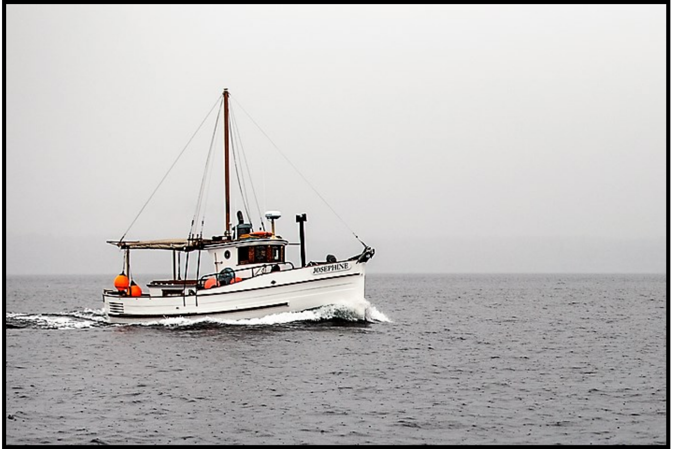
Figure 4 moving gracefully thru the water