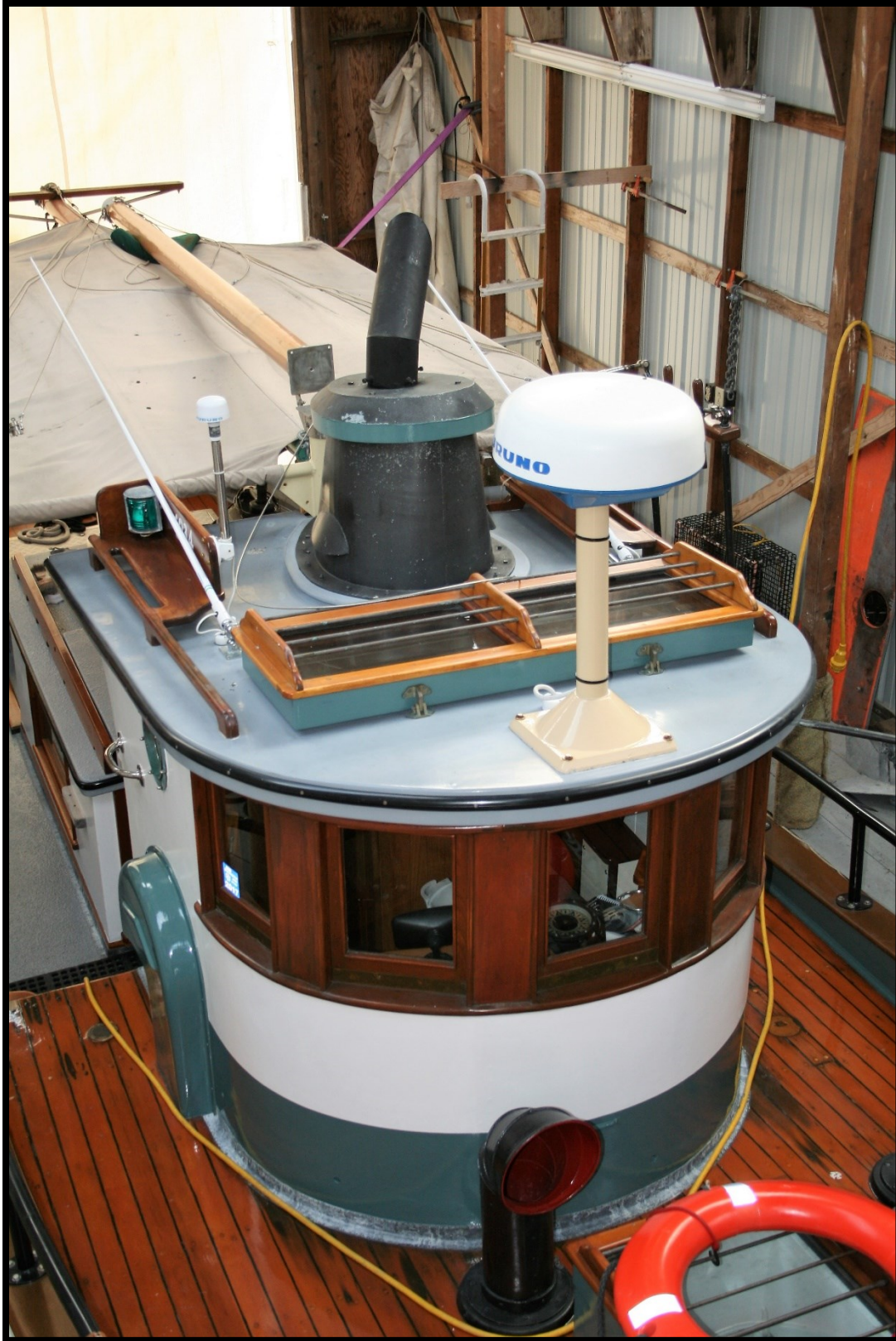
Figure 11 Pilothouse and covered cockpit boom tent.